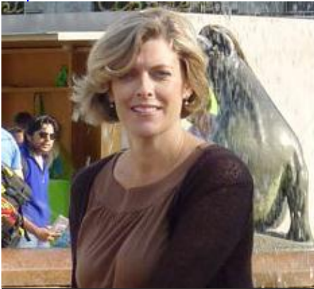
Coles County Board of Directors Secretary